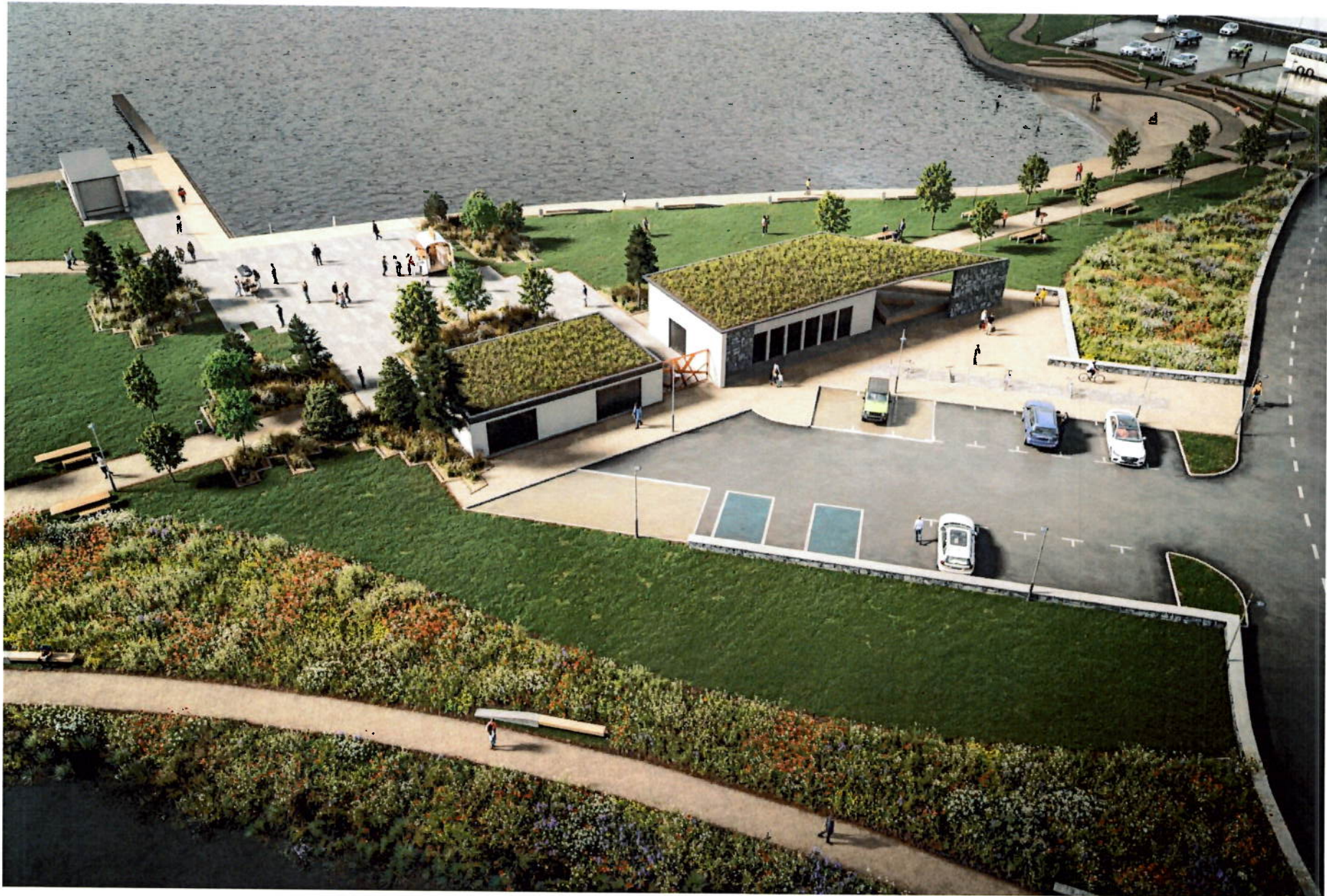
▲ 3d Render; Proposed Development