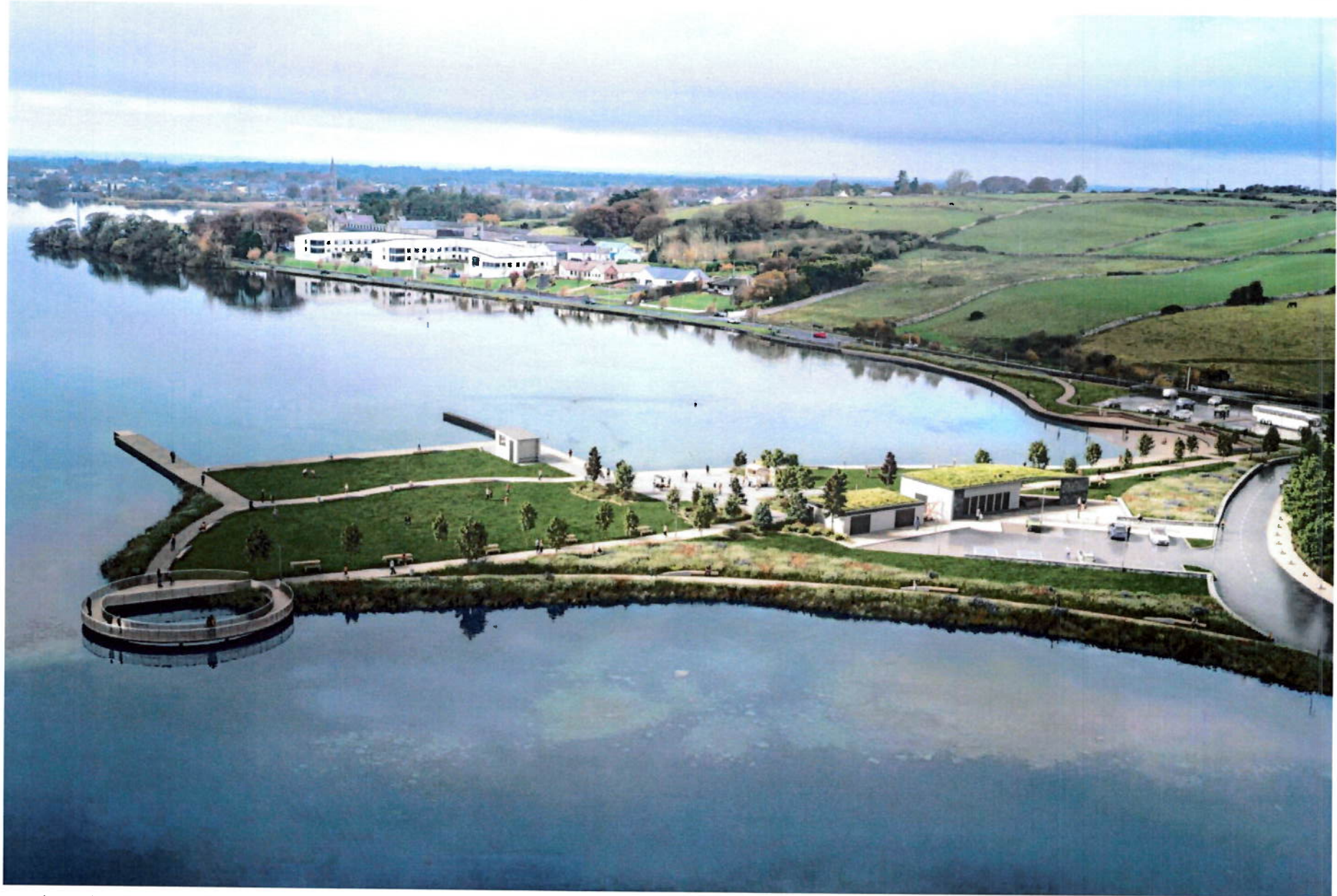
▲ 3d Render; Proposed Development