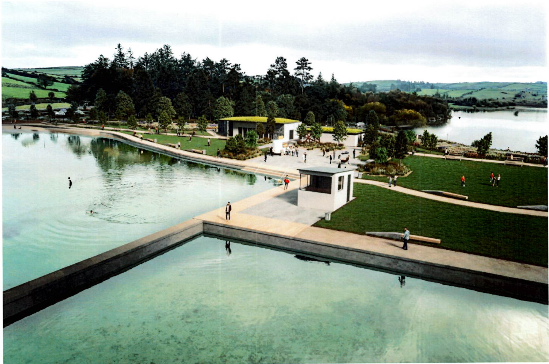
▲ 3d Render; Proposed Development